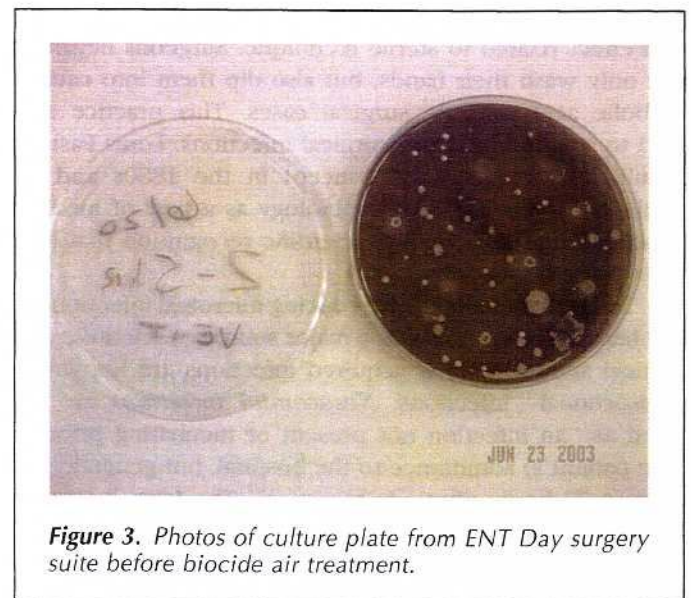
Figure 3. Photos of culture plate from ENT Day surgery suite before biocide air treatment.

Clearly, the clinical environment presents challenges not seen in the clinical laboratory. We counted 15 variables that contribute to the possibility of creating a nosocomial infection or cross-infection in the healthcare arena. The PCR biocide unit is normally mounted on the ceiling. Due to time constraints, logistics, and the need to reuse some units in other clinical areas, the units were mounted on stainless steel carts, 36 in above the floor. They were positioned in areas around the patient-care setting to place them in the airflow path. The effect of not mounting the units on the ceiling certainly decreased their efficiency. To what extent the “kill block” was decreased cannot be determined. It is significant that even in this nonoptimal position, the units had a significant effect in decreasing the CFU counts. The addition of personnel or equipment to an area creates air turbulence. Air turbulence is defined as chaotic, nonlinear motion of a fluid. A swirling effect is created in turbulent air. As a result, the direction and force of the air are changed from its original path. Filtering systems depend on a consistent airway path. Certain pathogens (disease-causing microorganisms) are carried by air currents (those pathogens sampled in this study). If the air pathway changes or turbulence occurs, it reduces the efficiency of the filtering system. The number(s) of personnel and equipment were required information on the data sheet for this reason. Each additional nurse,